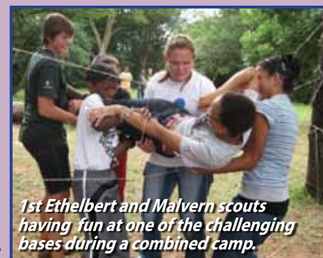
1st Ethelbert and Malvern scouts having fun at one of the challenging bases during a combined camp.